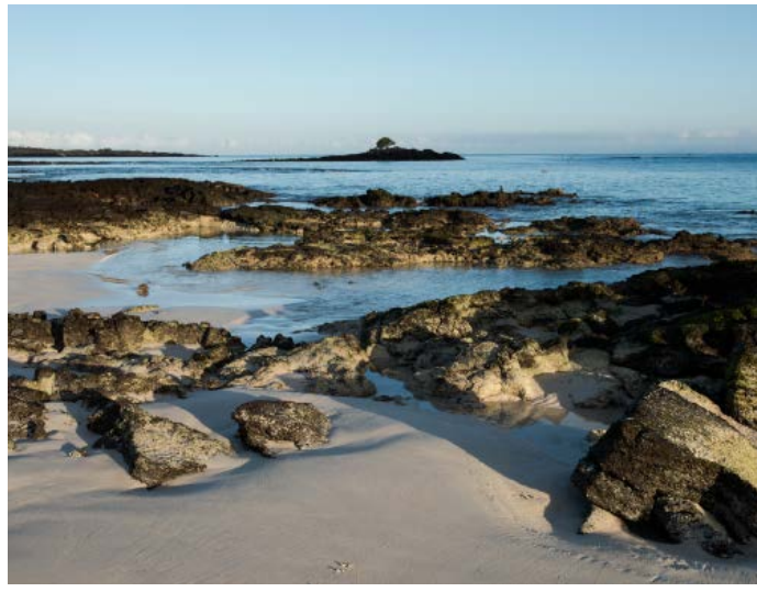
pm – Baltra Island Airport

Difficulty level: easy Type of terrain: sandy Duration: 1-hour walk